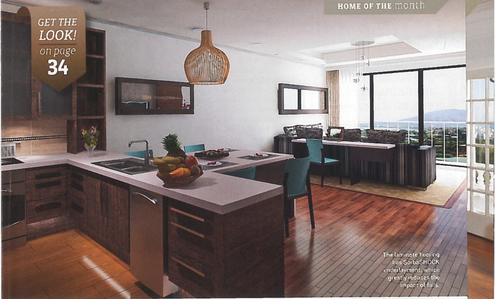
The laminate flooring has SorbaSHOCK underlayment, which greatly reduces the impact of falls.