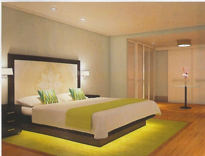
Virtual images created by Ventus Design

Do you expect your home not just to be safe and functional for all members of your family but a space which expresses who you are?